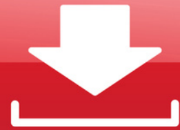
Tabit 2.01 Full Utorrent